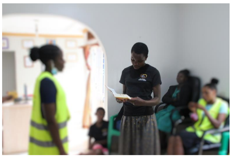
Figure 5 bible study time