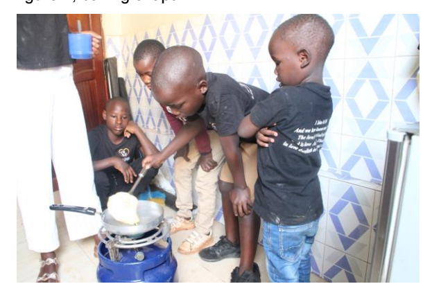
Figure 8; frying the chapattis