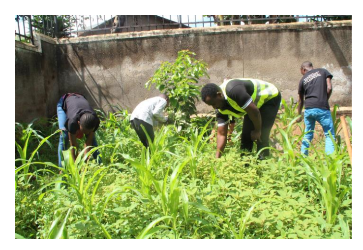
Figure 4; removing weeds from the garden